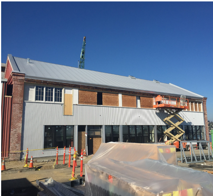
Construction taking place on WETA's new Mare Island Ferry Facility

Since its groundbreaking ceremony in May of last year, significant progress has taken place on the construction of the North Bay Operations and Maintenance Facility project on Mare Island that will provide a base for the Water Emergency Transportation Authority's (WETA) Vallejo ferry fleet.